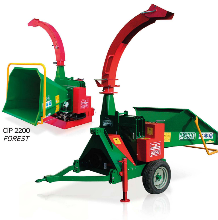
CIP 2200 FOREST